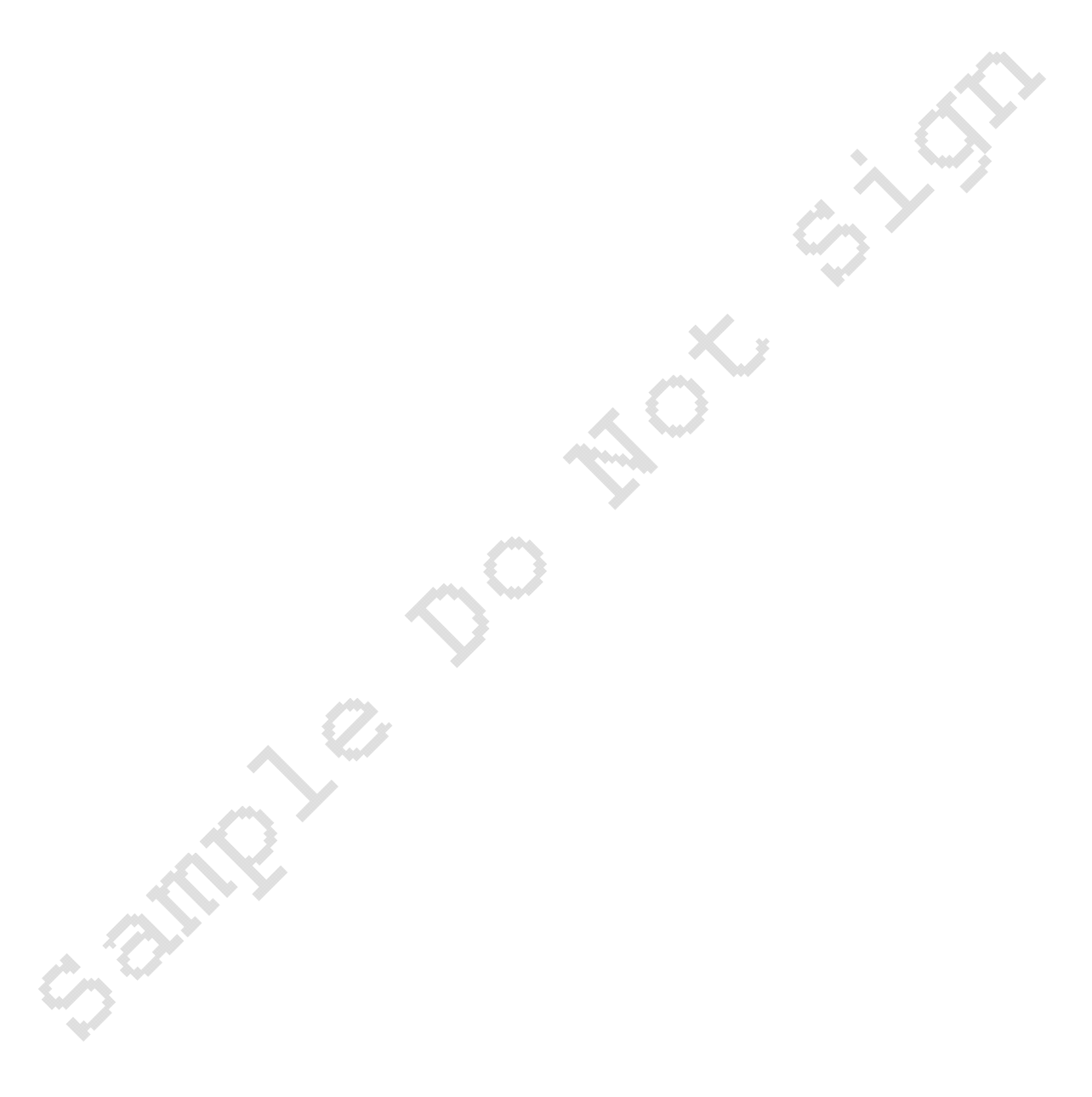
EXHIBIT B CONTRACTOR'S PROPOSAL TO RLI #20041JLS PHARMACEUTICAL FOR BSO FIRE RESCUE REGIONAL LOGISTICS