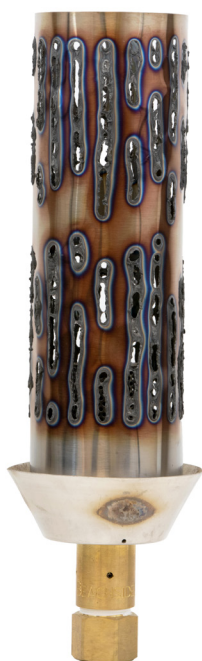
TK-N-OHE (Natural gas) TK-P-OHE (Propane gas)