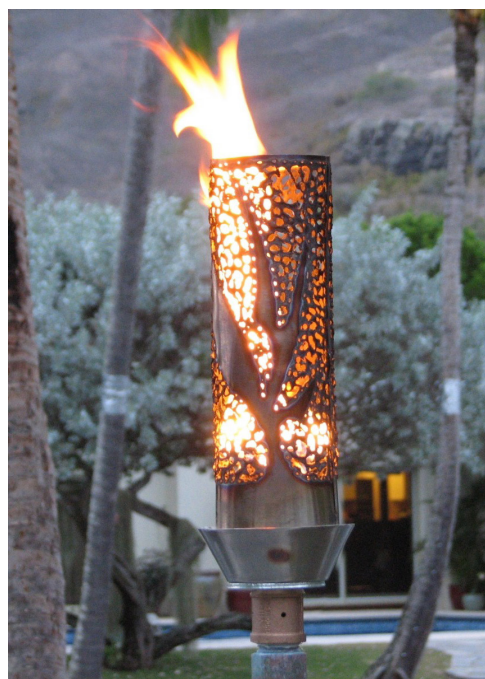
BOP "Bird of Paradise"