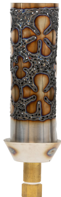
TK-N-PUA (Natural gas) TK-P-PUA (Propane gas)