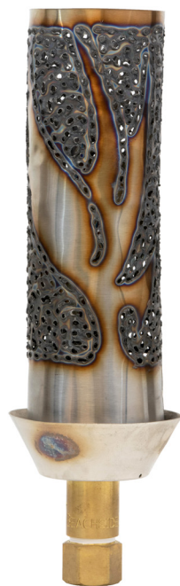
TK-N-BOP (Natural gas) TK-P-BOP (Propane gas)